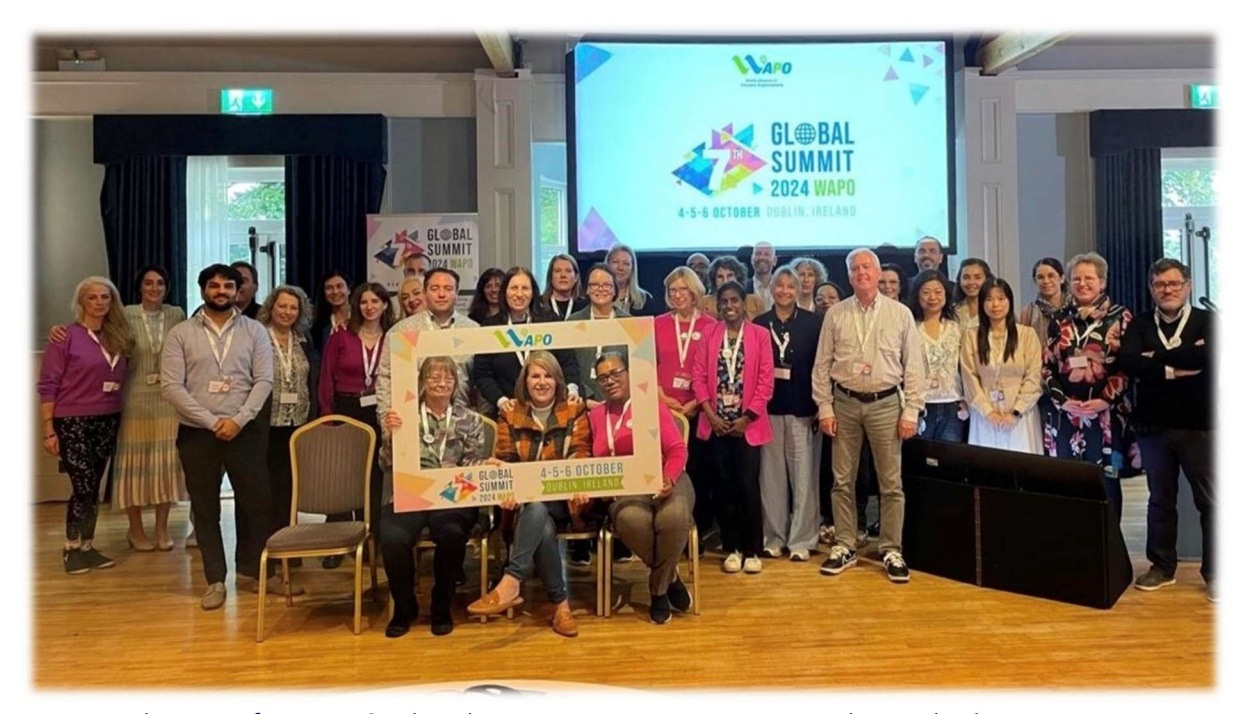
Patient Advocates of Pituitary & Adrenal Patient Organizations, Guest Speakers and Industry Representatives

Industry representative : Thank you so much for the great meeting of last week and for having us to listen and to participate to the event.