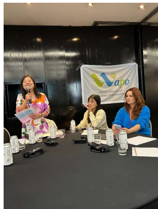
Question by Jianmin Chen (Hypercortisolism PAG, China)